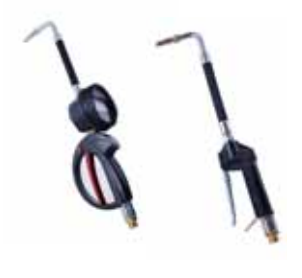
Meters and dispense units For all types of fluids