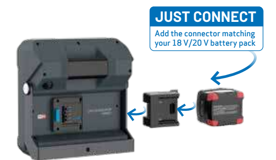
Use the SCANGRIP CONNECTOR to attach your 18 V/20 V battery pack to the VEGA CONNECT lamp