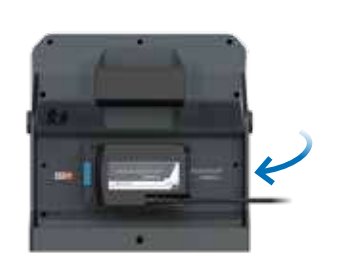
Use the POWER SUPPLY for direct power