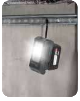
Built-in hook for suspension