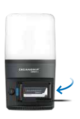
Use the POWER SUPPLY for direct power