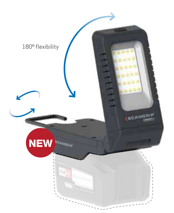
BASIC CONNECT € 59.90

It is especially characteristic of the BASIC CONNECT that the lamp head has dual axis rotation. This means that the lamp head is 180^{\circ} flexible from folded position. Furthermore, the lamp head can be rotated 180^{\circ} sideways providing completely flexible positioning of the light.