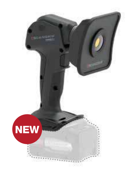
MULTILIGHT FLOOD CONNECT