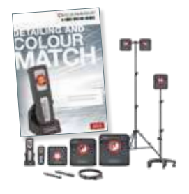
Specialized work lights for the painting industry