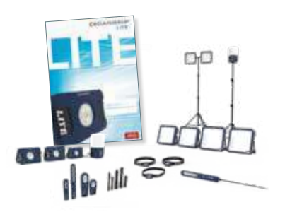
Professional range of work lights with unmatched value for money