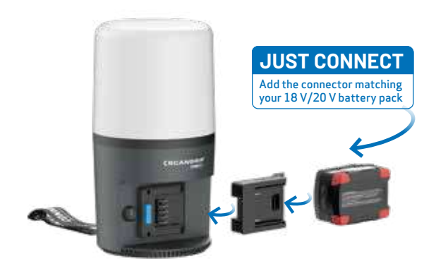
Use the SCANGRIP CONNECTOR to attach your 18\,V/20\,V battery pack to the AREA 6 CONNECT lamp