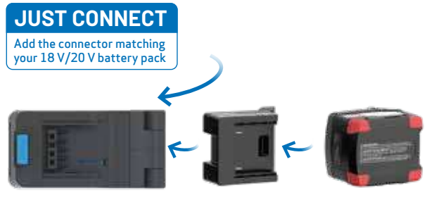
Use the SCANGRIP CONNECTOR to attach your 18 V/20 V battery pack to the BASIC CONNECT lamp