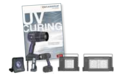
Portable lights for fast curing