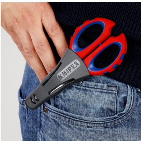
!Sicher verstaut und immer griffbereit!