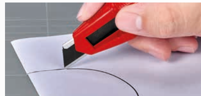
Ergonomic shape with numerous grip zones ensures safe and precise work.