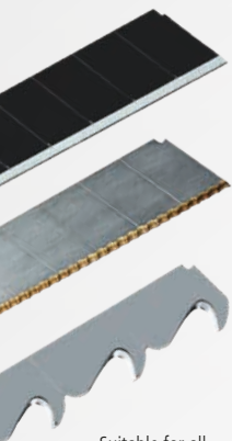
Suitable for all common 18 mm snap-off blades