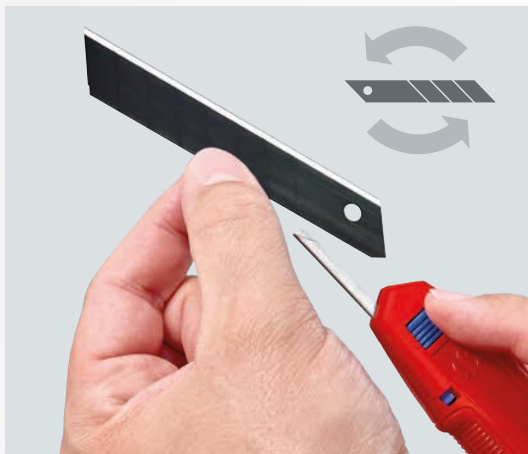
Quickly sharp again: The blades can be switched without any tools by just one push of the button.