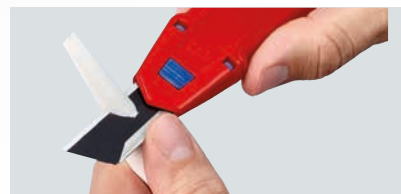
The innovative blade stabilisation allows you to apply more secure pressure directly on the blade.