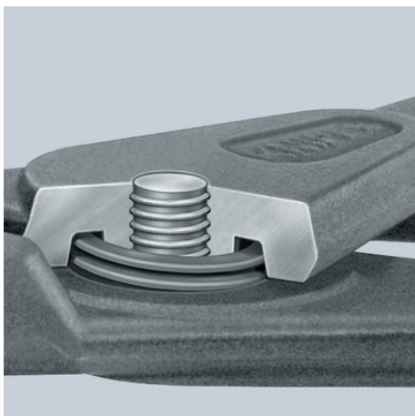
Spring inside the joint: the spring is protected inside the precisely bolted joint. It does not hinder work and cannot get dirty or lost.