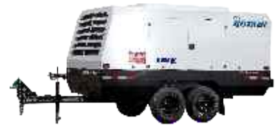
Oil free series screw 45 - 450 kW / 5.38 - 73.65 m 3 /min